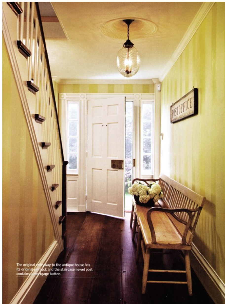
The original entryway to the antique house has its original iron lock and the staircase newel post contains a mortgage button.

"Compared to the main house, the cottage has a completely different personality," she continues. "It's more casual and fun." Freehauf achieved the desired informality via casual cottons and linens, cotton velvet, quilts, wicker, and ticking stripes. Rugs were kept to a minimum, except