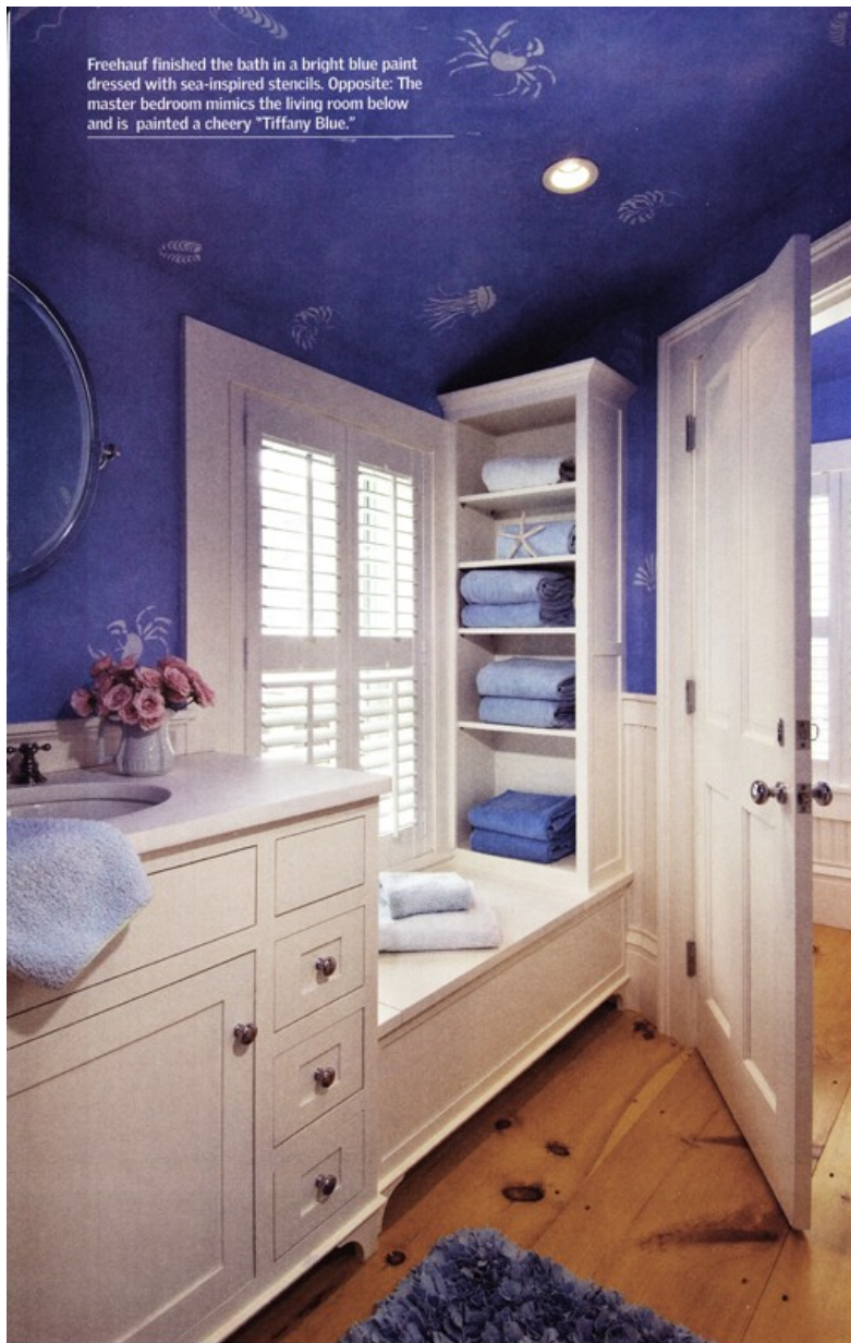
Freehauf finished the bath in a bright blue paint dressed with sea-inspired stencils. Opposite: The master bedroom mimics the living room below and is painted a cheery "Tiffany Blue."